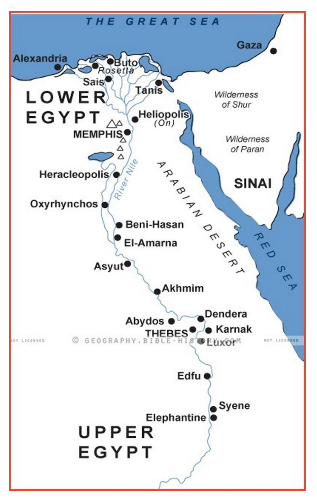
Since 96% of Egypt is dessert, the cites were located along the Nile River.